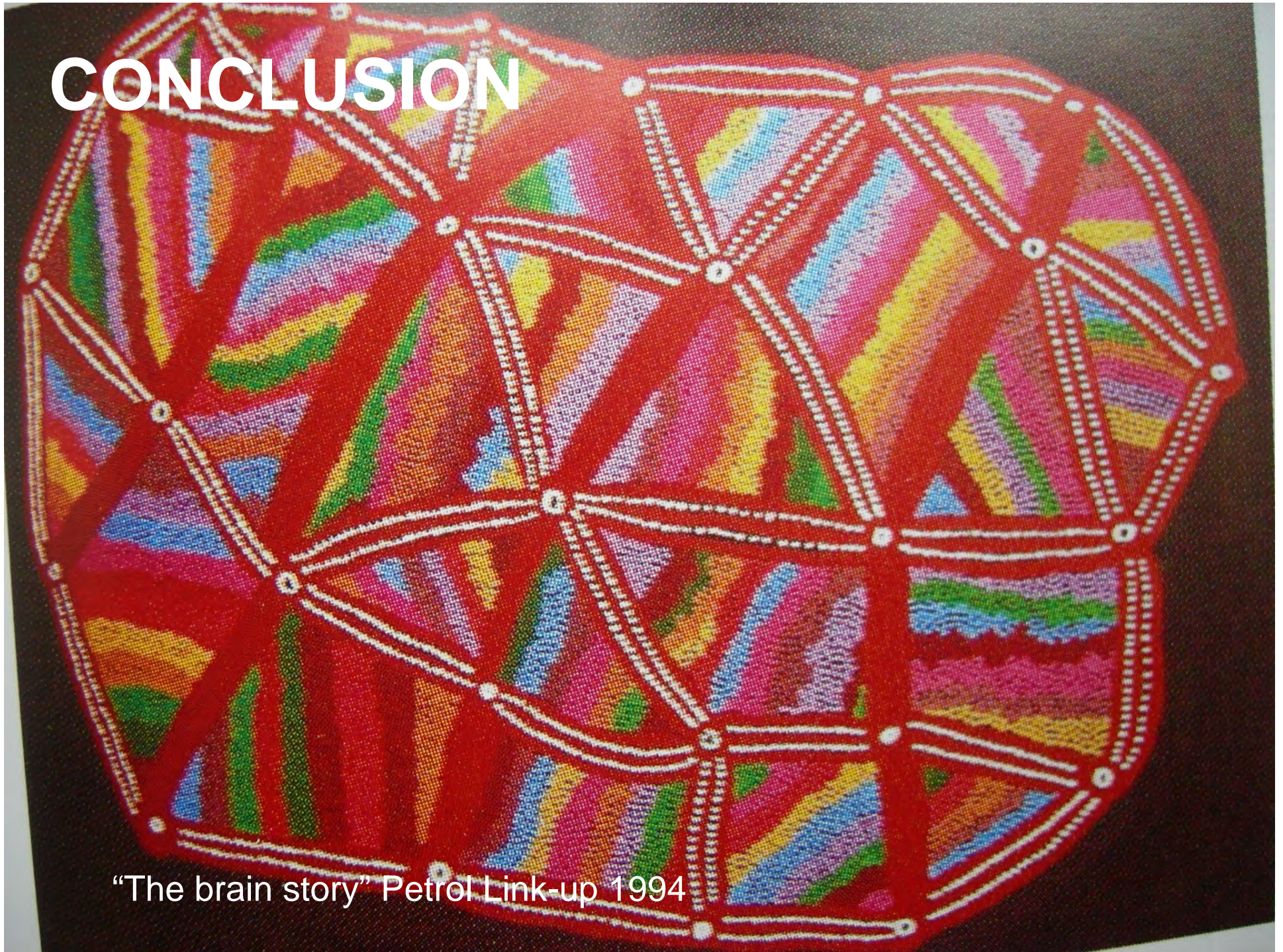
"The brain story" Petrol Link-up 1994